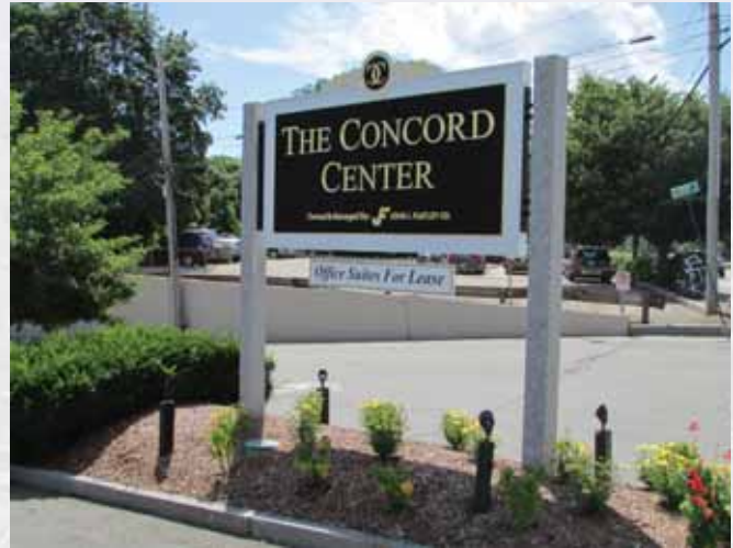
Directly Located off Main Street