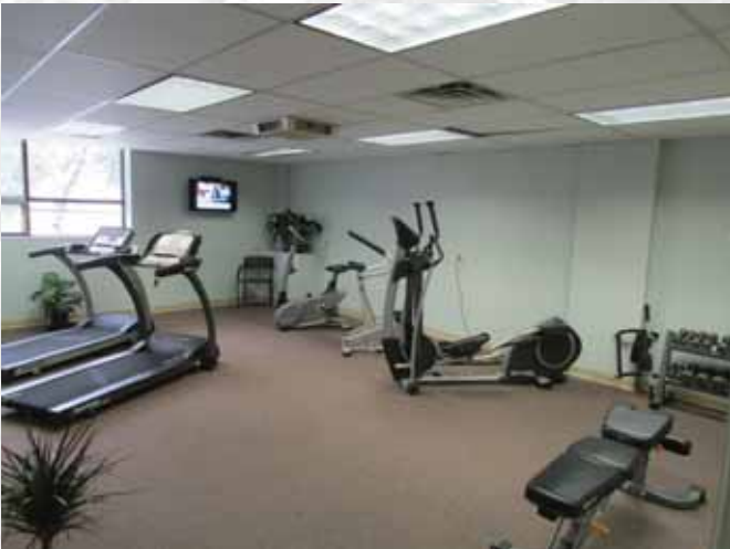
Newly Renovated Fitness Center