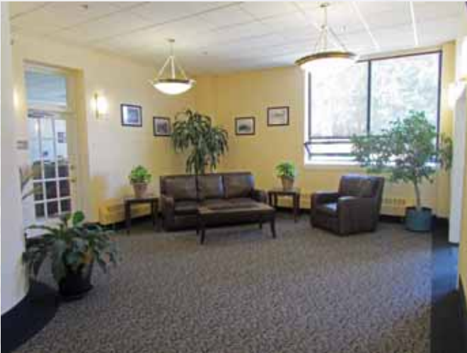
Upgraded Common Areas