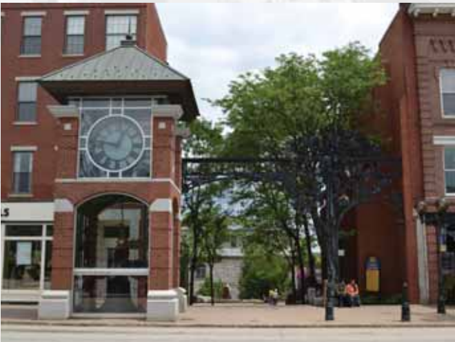
Walking Distance to Downtown Concord