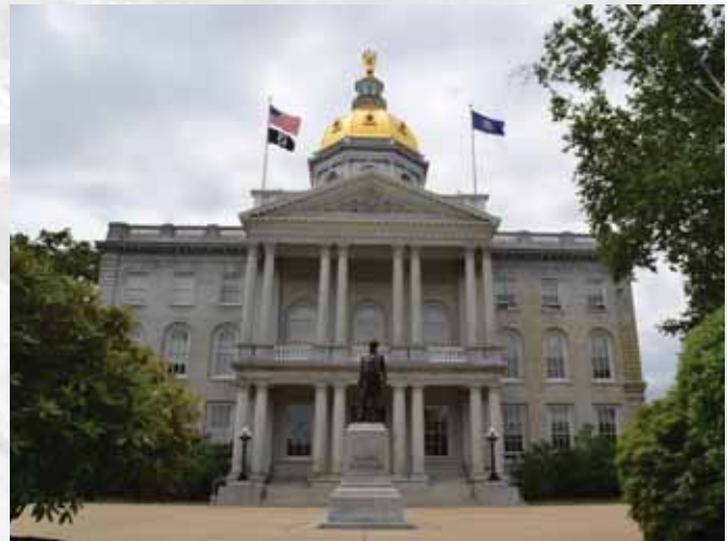
Walking Distance to the New Hampshire State House