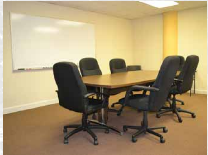
Shared Conference Room